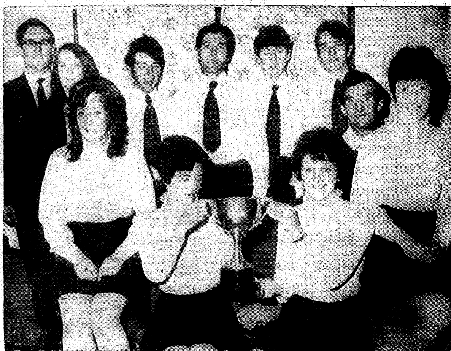
Touraneena Set Dancers who won the Coiste um Ceol mark in the final. Oideachas Cup at Ballymacarby heating Clashmore by one mark in the final.

OUR FORECAST CORNER S.F.C.—(2 games)—Kilrossanty, Kill. I.H.C.—(1 game)—Shamrocks. J.F.C.—(1 game)—Slabh gCua. J.I.C.—(1 game)—Ardmore. U-14 F.C.C. (3 games)—Affane/Cappoquin, Lismore and Abbeyside. U-14 H.C.—(1 game)—Abbeyside. U-16 H.C.—(2 games)—Fourmilewater and Ballinacoola. U-16 F.C. (2 games)—Tallow and Dungarvan. LAST WEEK Last week we gave a total of eleven forecasts. Three games failed to take place, one game was drawn and at the time of writing, three of the U-16 games have yet to be played, the other four forecasts proved correct. Of the four results we were awaiting on last week — one game (I.F.C.) Ardmore v. Ring failed to take place, one game U-14F. (Nire v. Brickeys) was a draw and of the remaining two, one was correct and Lismore U-14 hurlers proved us wrong by ousting county champions, Tallow. TO DATE. 59 forecasts : 43 correct, 12 incorrect, 4 drawn.