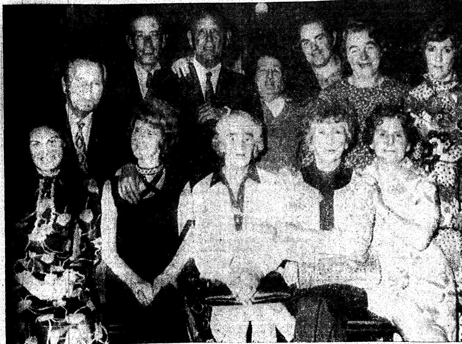
GROUP PICTURED AT THE LABOUR SOCIAL AT LAWLORS HOTEL