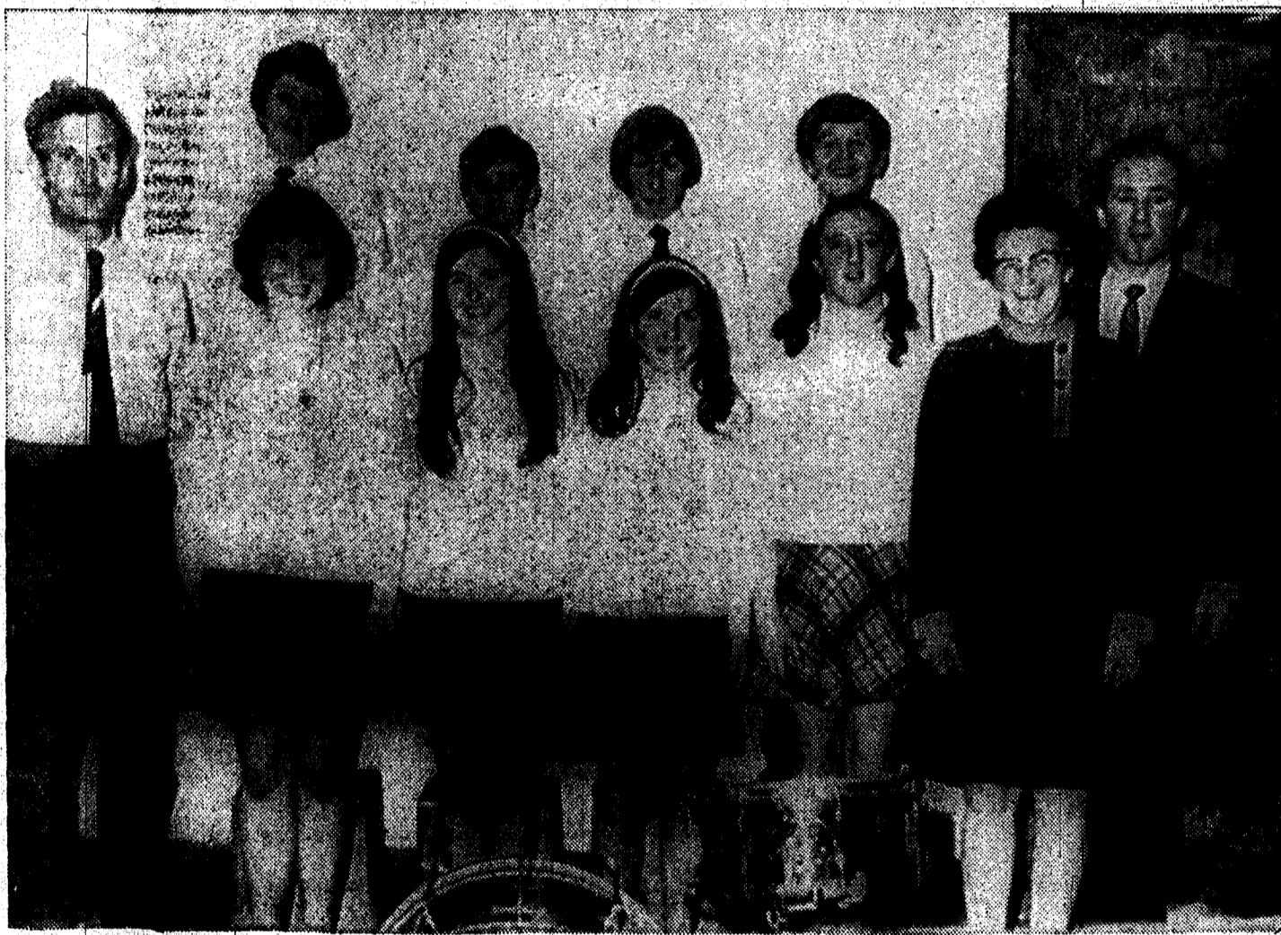
St. Mary's Youth Club Set Dancers