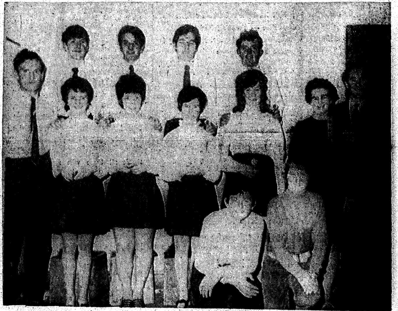
St. Mary's Set Dancers, Touraneena - SECOND