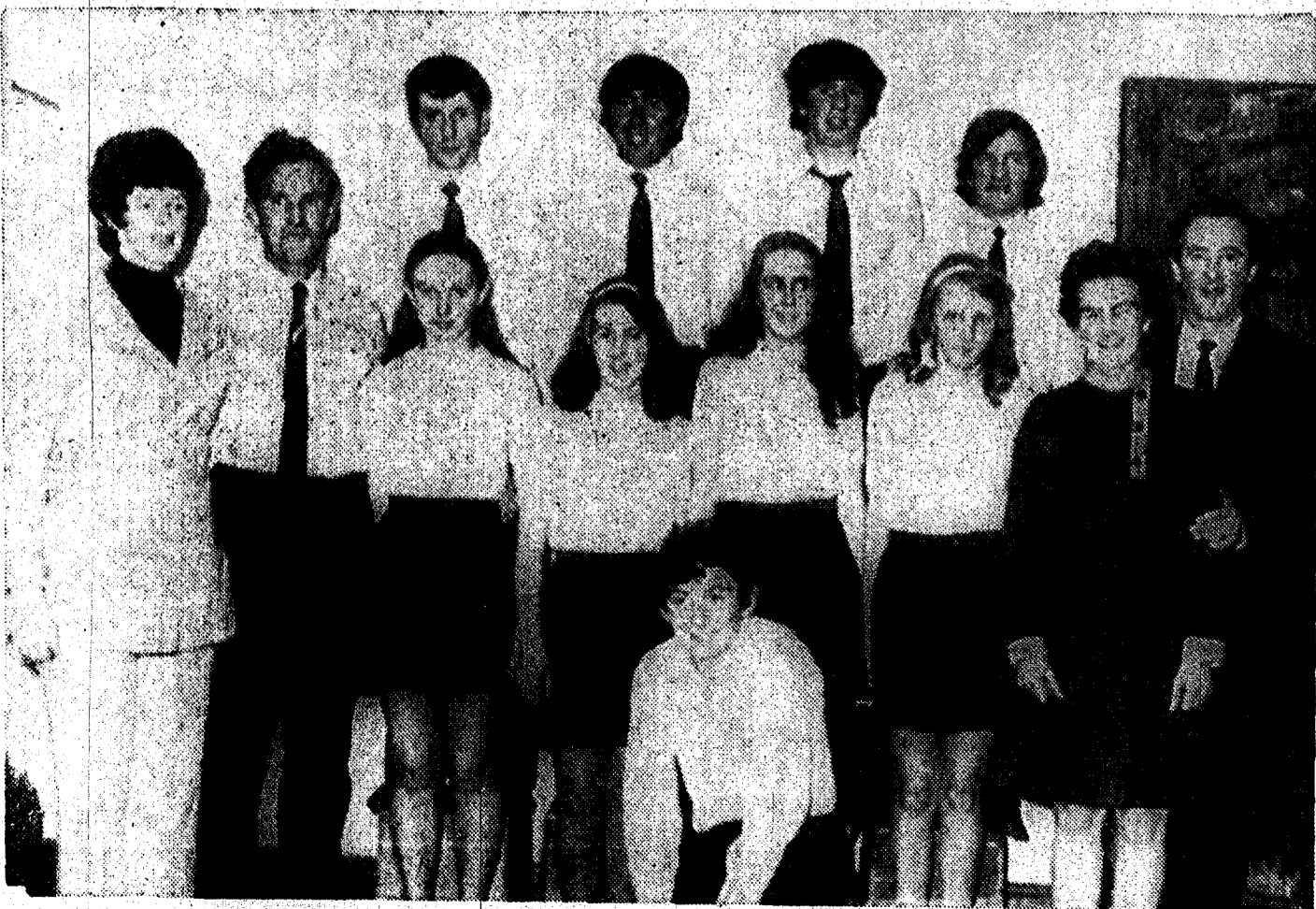
Newcastle J. Set Dancers