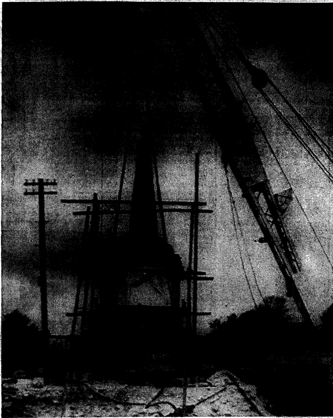
THE MASTER McGRATH MONUMENT being moved into position at the new round-about at Ballymacmague.