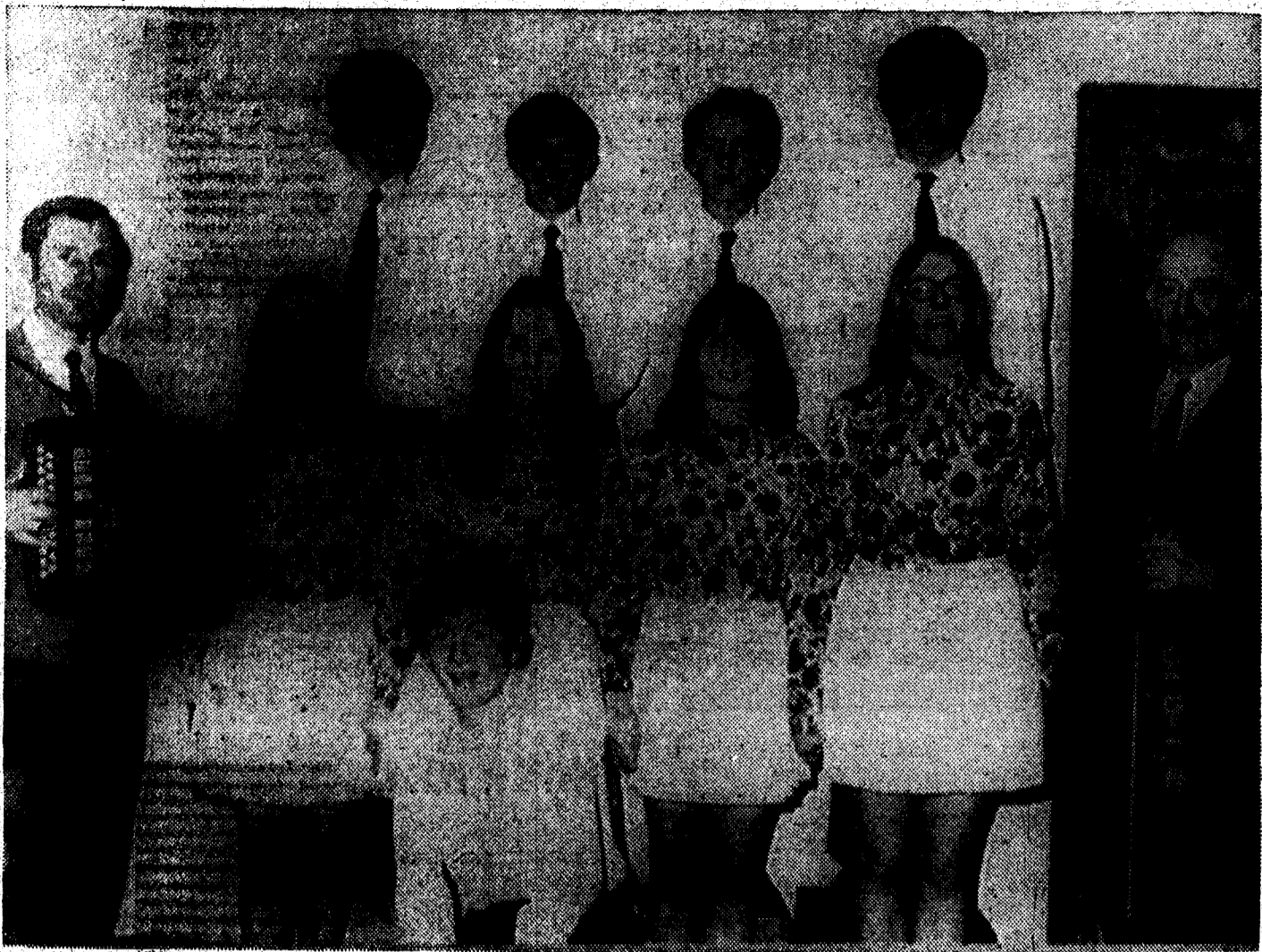
Ballymacarbry Youth Club