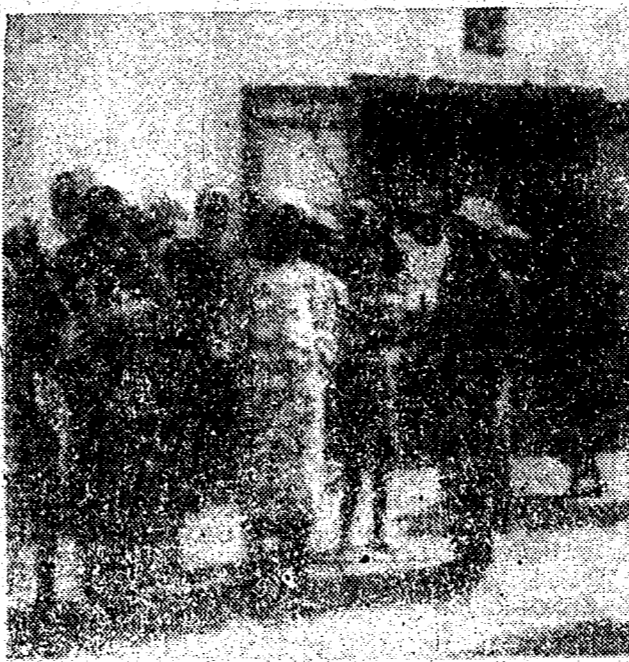
Gathered after Mass in the Bush for a chat and photo.