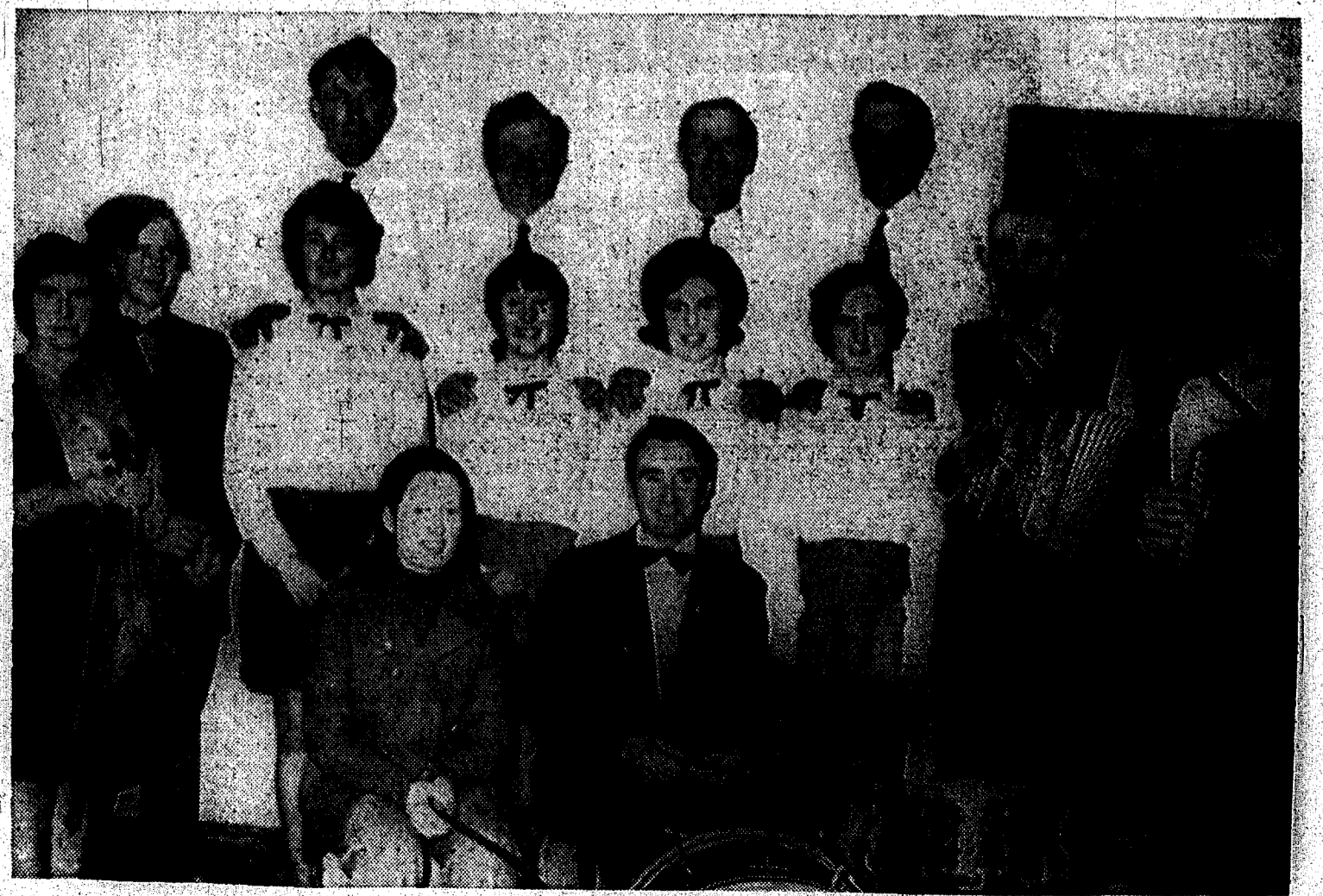
Clashmore Set Dancers - THIRD