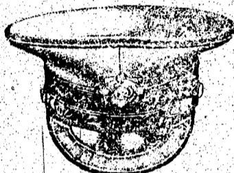
£3,745 Chief Superintendent

*These rates are due to be increased as and from January 1, 1972 under the terms of the National Pay Agreement.