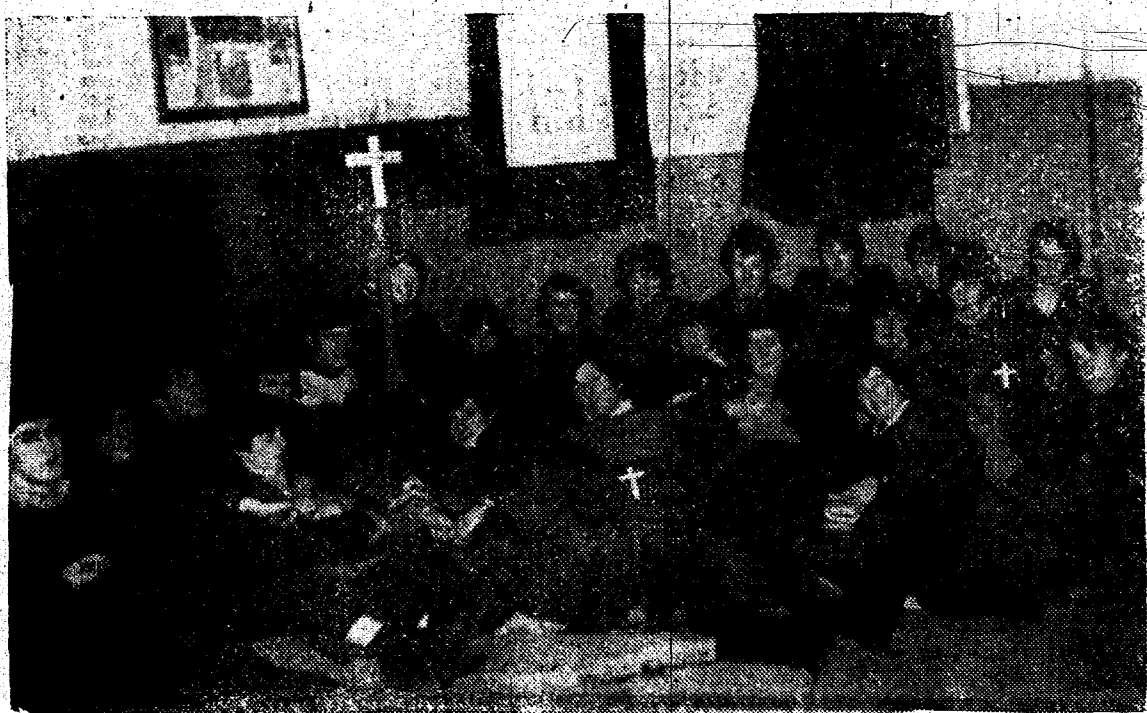
Fifth year students of the St. Augustine's College who staged a 27-hour Fast in aid of the dependants of the thirteen kill in Derry.