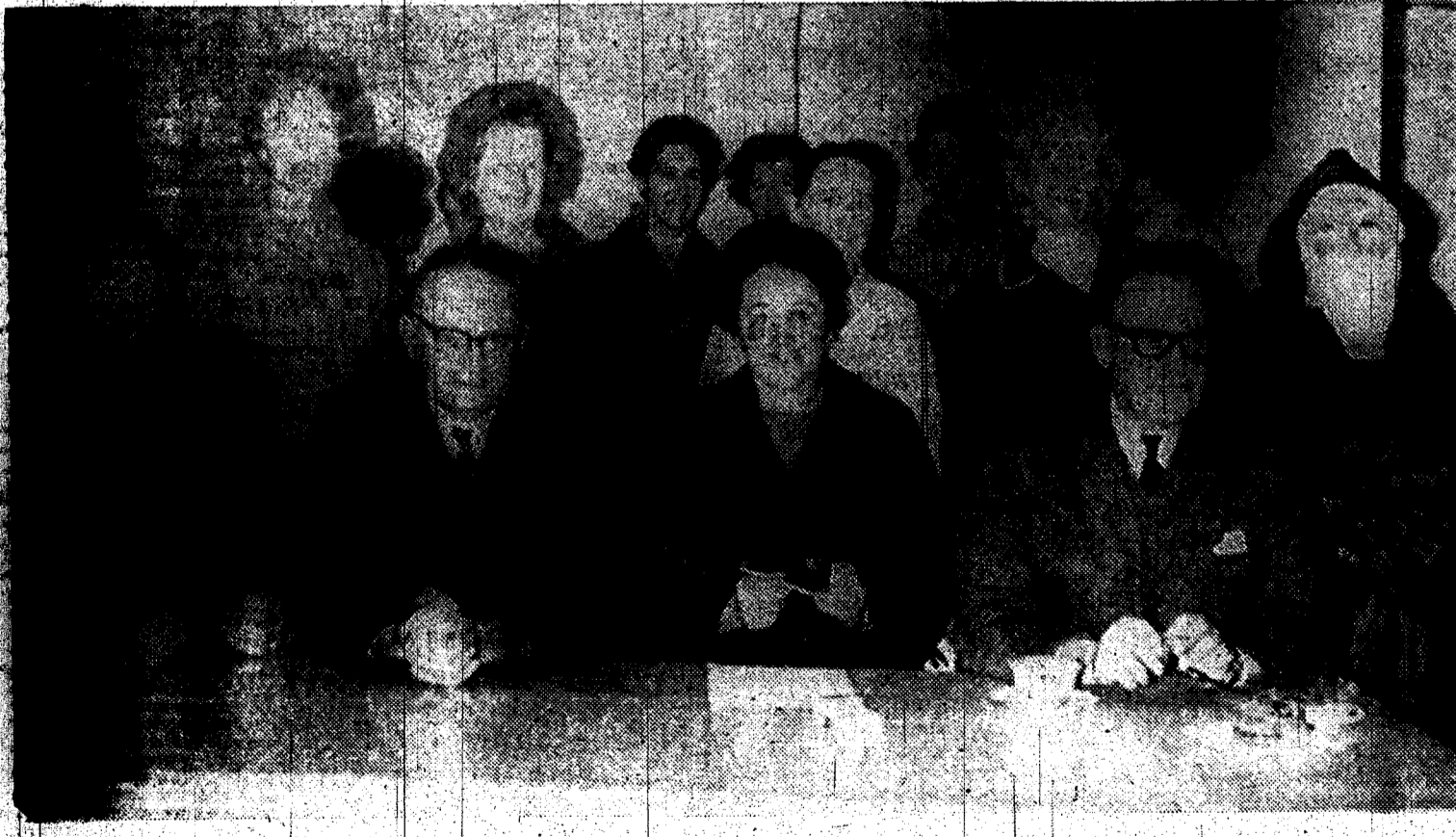
Members of the Committee of St. John's Handicapped School at the Xmas Party