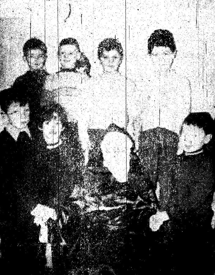
People enjoying the St. John's School Xmas Party

RENT A NEW 22" COLOUR TV FOR ONLY £1.71 WEEKLY ● Black-and-White Sets from 45p weekly ● RTV RENTALS MAIN STREET DUNGARVAN Phone 252 36 BRICKY'S THROUGHOUT IRELAND