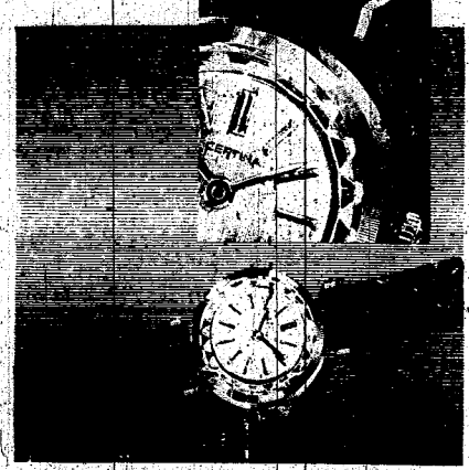
CERTINA "Sapphire" with faceted sapphire glass in 18 kt. gold

Choose a CERTINA Sapphire ... and be sure!