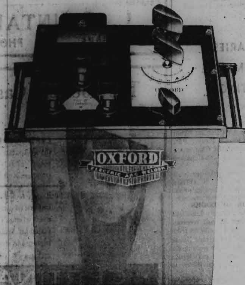
THE OXFORD ARC WELDER

54 MAIN STREET, DUNGARVAN Phone 240 FOR ALL YOUR WELDING REQUIREMENTS Always striving to give you better value we have pleasure in presenting the new OXFORD WELDER at the amazing low price of £27 unbeatable value