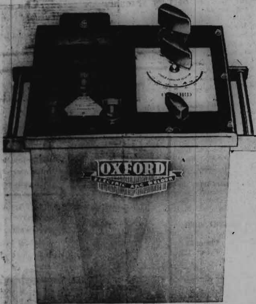
THE OXFORD ARC WELDER

FOR ALL YOUR WELDING REQUIREMENTS Always striving to give you better value we have pleasure in presenting the next OXFORD WELDER at the amazing low price of £27 unbeatable value