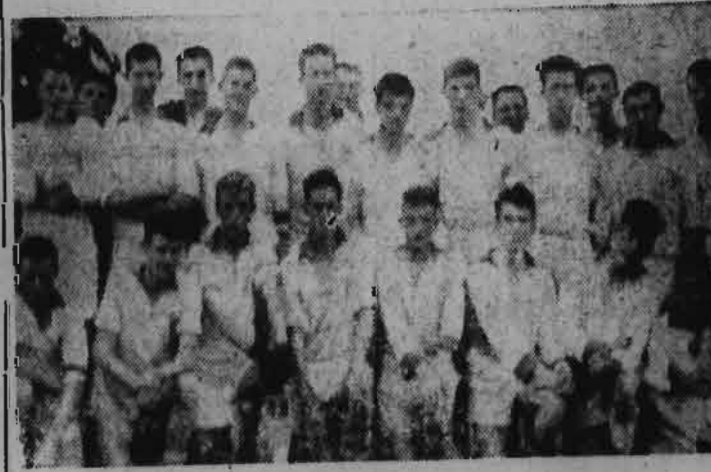
THE DUNGARVAN TEAM

continuous thrills both attacks missed all-angled chances of scores and fittingly enough turned over on level terms 0-2 each.