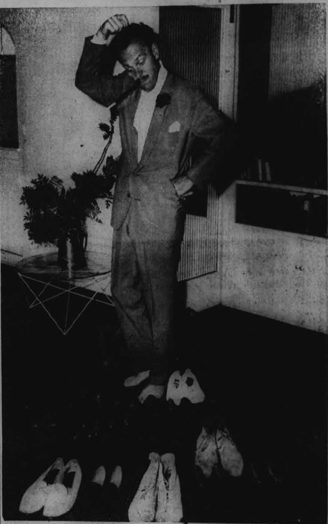
Which pair to wear? Comedian Terry Thomas, at his Kensington home, finds it a problem to choose from his shoe wardrobe of 48 pairs.