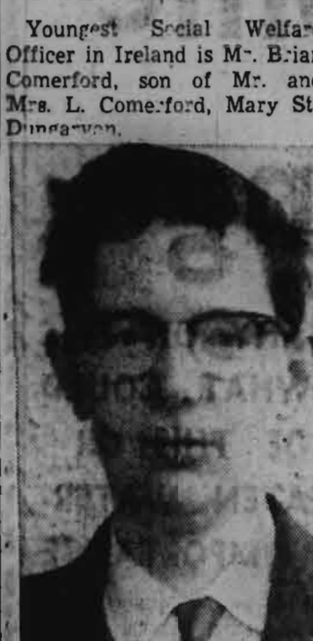
At the age of 18 he was appointed, following an open competitive examination.