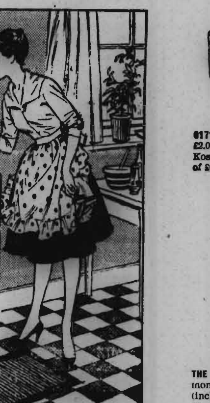
THE MAIN TALISMAN has value for money family cooker, £21.95 down, including 2 cylinders of Kosangas and 30 monthly payments of £1.12 or £7.75 cash.