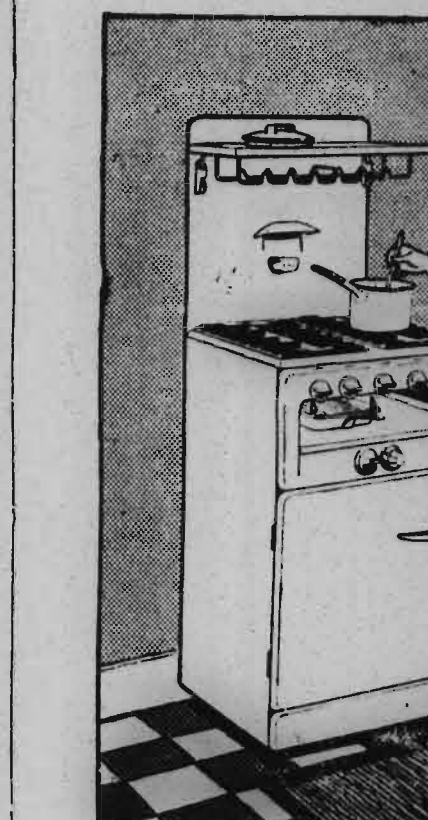
THE RADIATION NEW WORLD 41—A LOVELY LOW PRICE FAMILY COOKER. Yours for only £14.95 (including 2 cylinders of Kosangas) and 30 monthly payments of £1.65 or £12.15 cash.

Next Draw: Tuesday 17th Nov ENJOY A GAME OF PONGO AT THE RECREATION HALL, MAIN STREET AFTER THE DRAW.