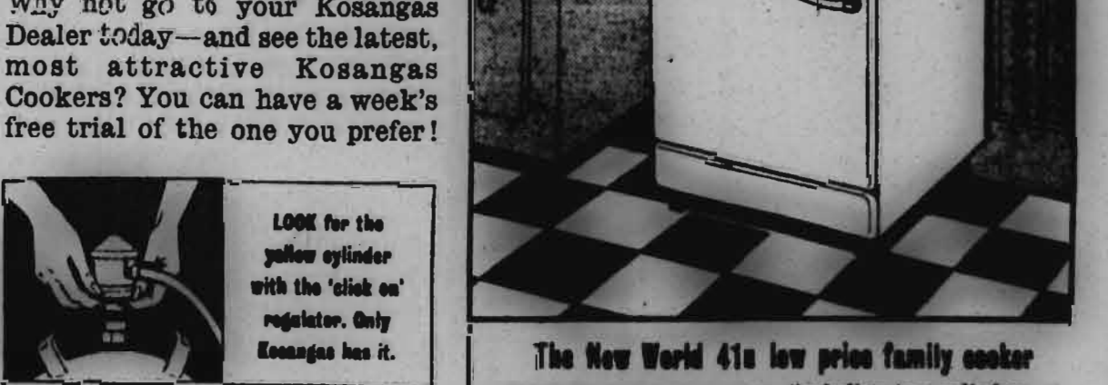
The New World 41a low price family cooker. Yours for only 22.0.0 down (including two cylinders of Kosangas) and 26 monthly payments of 2.2.0 or 22.1.0 cash.

BEST AND CHEAPEST Kosangas is the best and cheapest bottled gas in Ireland - only 18/6 per refill cylinder. Why not go to your Kosangas Dealer today - and see the latest, most attractive Kosangas Cookers? You can have a week's free trial of the one you prefer!