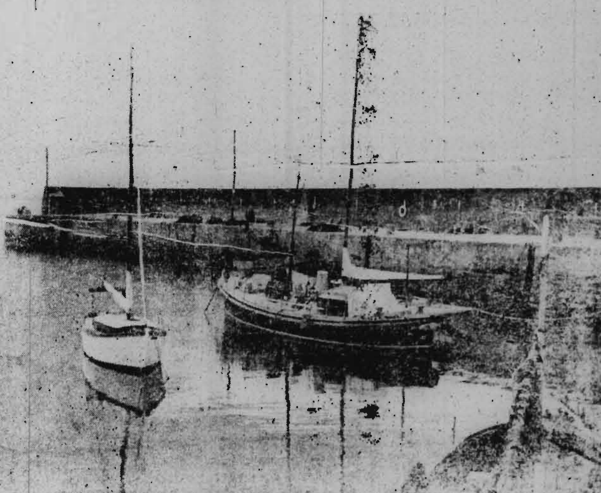
Home to Helvick comes the Local Lifeboat