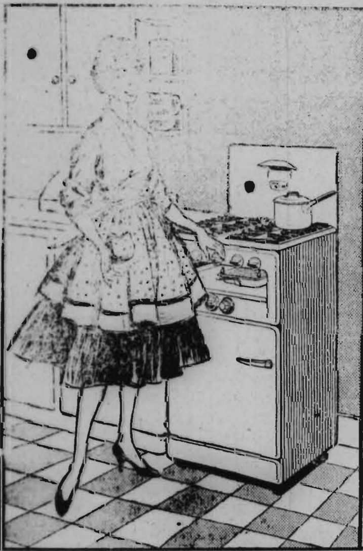
The NEW WORLD 41u. (left)