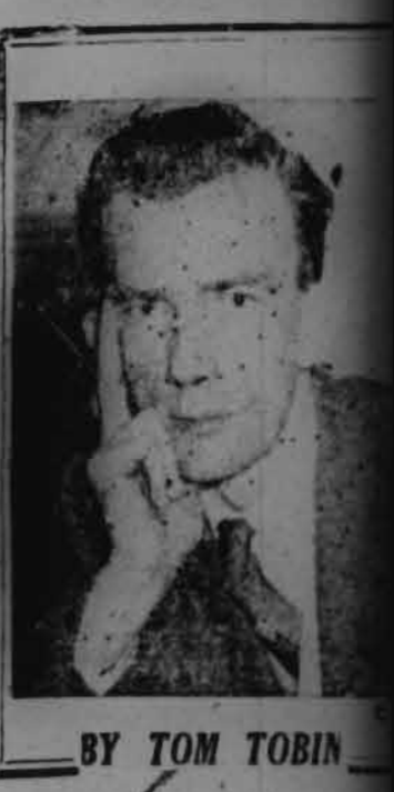
BY TOM TOBIN