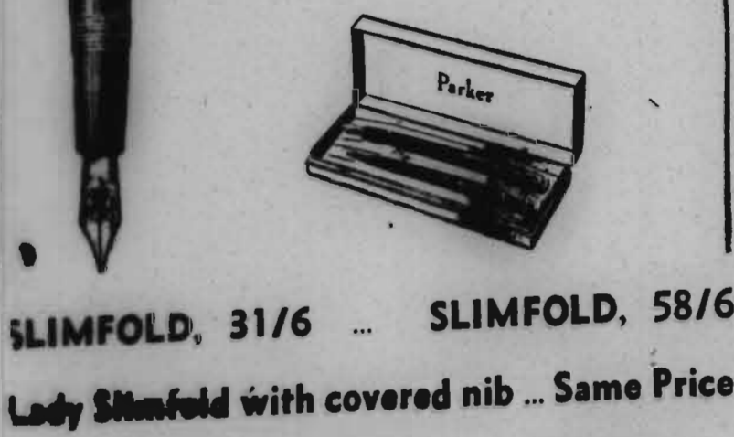
SLIMFOLD, 31/6 ... SLIMFOLD, 58/6 Lady Slimfold with covered nib ... Same Price

Available in four colours with choice of eight nib grades. Rotary pencil to match.