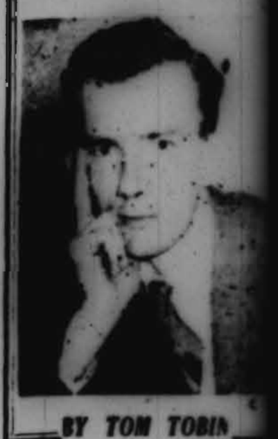
BY TOM TOBIN