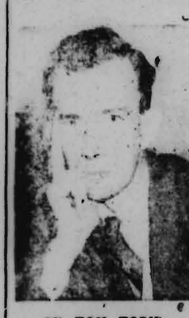
BY TOM TOBIN