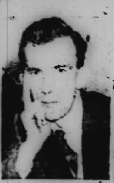
BY TOM TOBIN