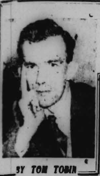
BY TOM TOMA