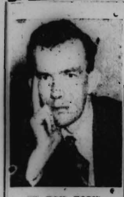
BY TOM TOBIN