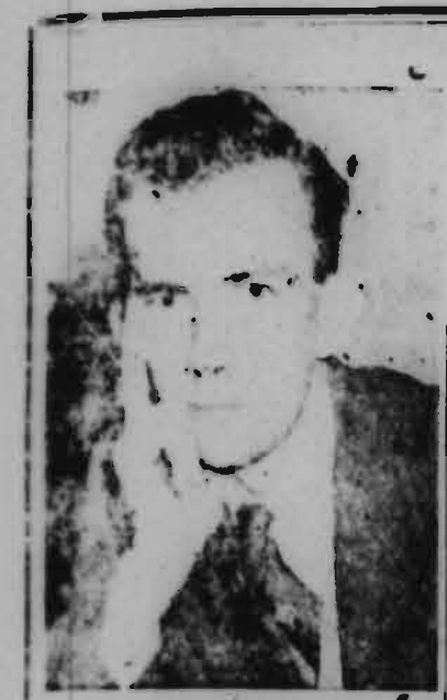
BY TOM TOBIN