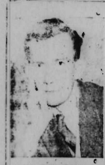
BY TOM TOBIN