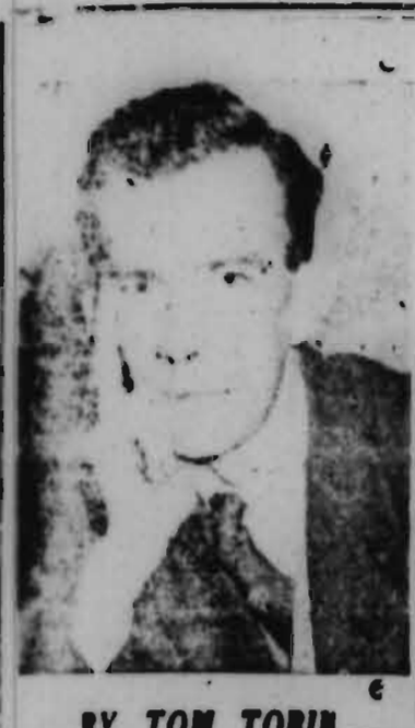
BY TOM TOBIN