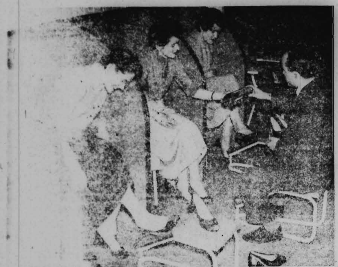
Interest has been aroused in the new Shoe Department at the Town Hall, where the latest styles in Spring Shoes are now in demand.

This brought an end to the discussion on the understanding that the Manager's report would be sought for the next meeting to say that the author of the letter was not appealing to the Valuation Officers.