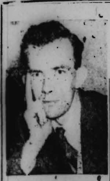
BY TOM TOBIN

He deserves to succeed - not alone because of his enterprise but also because of the fact few motorists can overlook - his willingness to oblige whenever humanly possible. Every good luck to him in the future.