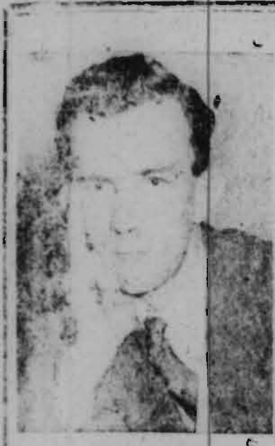
BY TOM TOBIN