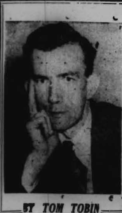
Abbeyside's great day