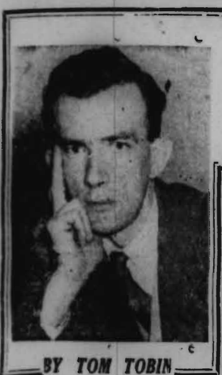
BY TOM TOBIN