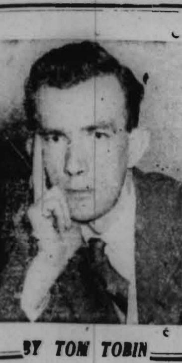
BY TOM TOBIN

GHAL WS AGAIN when it over 20,000 the moor- lands in the of the of May was of time at the time many of might have swept against The matter is by the local have suffi- times to protect of bad to guard such irre- of infor- are ham- and the slightest in pass- the parties re- to justice. of early on the weighing the Promenade practically would seem attempts it over the to the hoar- on the wall the path. It is an an- with a view of the