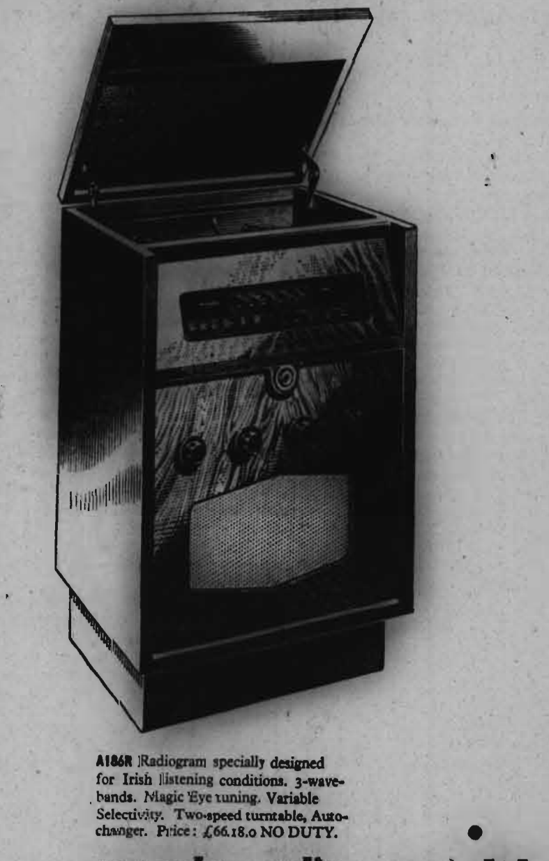
MURPHY RADIO (IRELAND) LTD. ISLANDBRIDGE DUBLIN