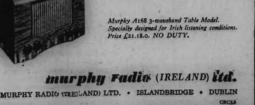
MURPHY RADIO (IRELAND) LTD. ISLANDBRIDGE • DUBLIN

Some men seem to think with their hands. You know the type. They whittle a lump of wood to a statuette in a jiffy. They mount a clockwork toy while you're still fumble-fumbling with loose springs. A lot of these men become radio dealers. And some of them become Murphy men. Out of the 800 or so radio dealers in Ireland, we've picked about 100. To be Murphy Dealers they don't need the golden tongue and the smooth charm of super-salesmen. We ask them to handle our sets because they are fine radio men—men we can trust not to do a shoddy job. Go and have a chat with the Murphy men in your district and listen to a Murphy set or two.