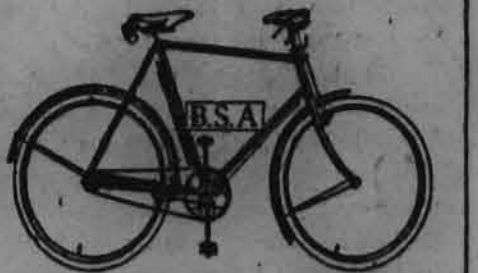
B.S.A. "EMPIRE" BICYCLE. Write or call for catalogue.

You can now obtain a famous B.S.A. Bicycle, backed by the vast B.S.A. organisation and guaranteed for 50 years, from £6.12.6 or £1 down. Every B.S.A. Bicycle has a wonderful reputation for reliability. Insist on a B.S.A.