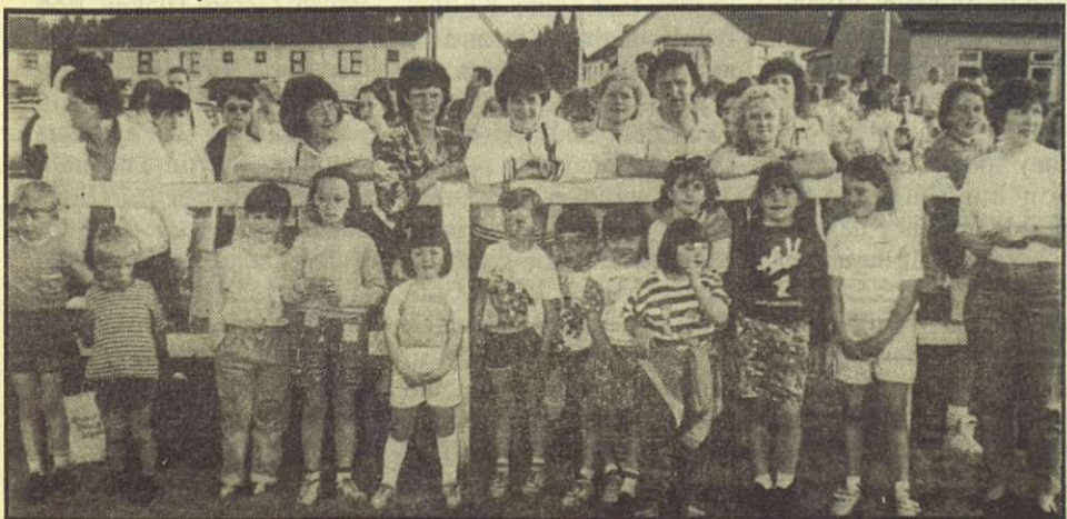
A section of the large crowd enjoying the game.

We wish a speedy recovery to Richie Finnegan, who is out injured at the moment.