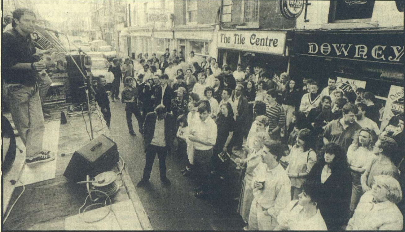
Scene at the launch of "The Wishing Stones" debut single "Surely" outside Downey's Bar, Main Street, Dungarvan recently. The single is now available in record stores nationwide. Hear this up and coming Dungarvan band, fresh from their Robert Palmer tour at Lawlor's Hotel, Dungarvan on this Friday night, June 14, with Support Group followed by a Disco.