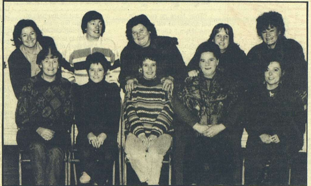
Some members of the ladies of the chorus of the Merry Widow