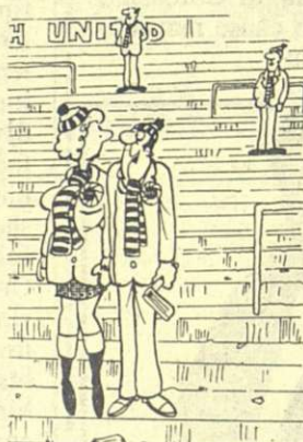
"Gets awful crowded on the terraces, doesn't it Miss?"