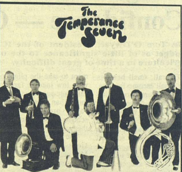
Paddy Cole (top); the Cluskey Hopkins Jazz Band (centre) and the famous Temperance Seven — some of the top attractions at Lawlor's Jazz Extravaganza from Feb. 14th to 17th. (See advert on Page 13).