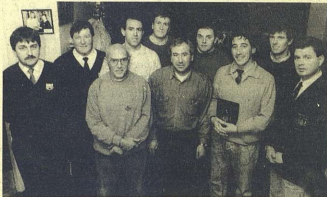
Officials of La Depeche team pictured with Dungarvan Rugby Club officials at the Irish Night in the Clubhouse after the friendly match between the two clubs at Ballyrandle.

February 10 — (Junior Cup) 1st XV v. Waterford City at Ballyrandle, kick-off 3 p.m.; (Casey Cup) 2nd XV v. Cappoquin at Ballyrandle, kick-off 1.30.