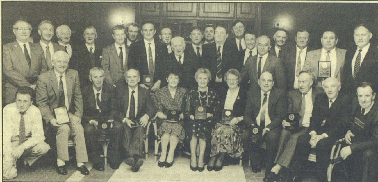
Players, officials and representatives of deceased members of the Colligan/Emmets teams of 1960-61 who were honoured at a function in the Park Hotel, Dungarvan.