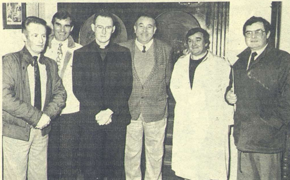
Lismore delegates pictured at the Waterford G.A.A. Convention at Lawlor's Hotel, Dungarvan recently. —(Photo by Kiely).