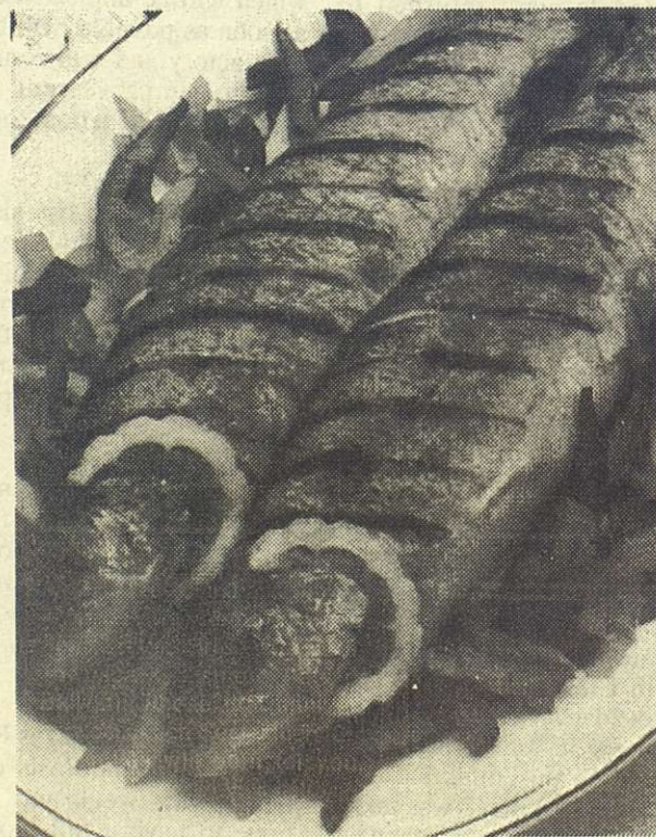
Marinated grilled trout with pepper medley.

In the meantime grill the trout under a pre-heated