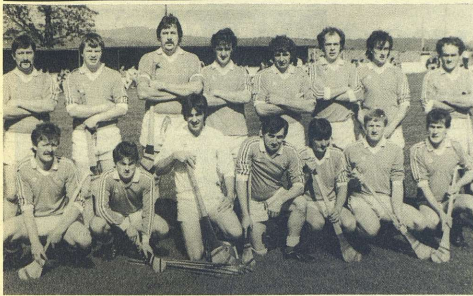
BALLYDUFF UPPER — who defeated Portlaw in their senior hurling quarter final game at Fraher Field, Dungarvan on Sunday last.