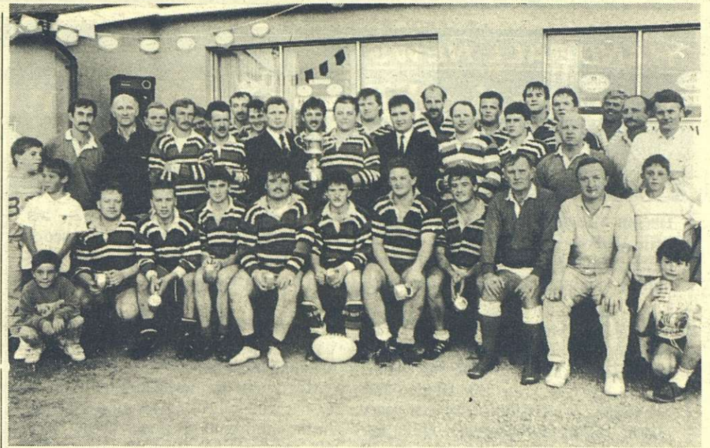
Clonmel Rugby team who were outright winners of the Hoffmans Rugby Festival played at Ballyrandle last Sunday.