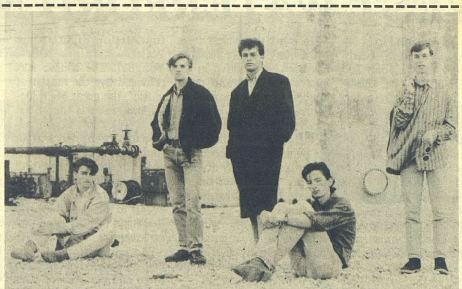
THE WISHING STONES — Playing at O'Bs (Minnies) on Thursday, December 7. Doors open at 9.30 p.m.

Tickets will be around £10 again this year, so we look forward to seeing everyone there. In the meantime, the compliments of the season to all.