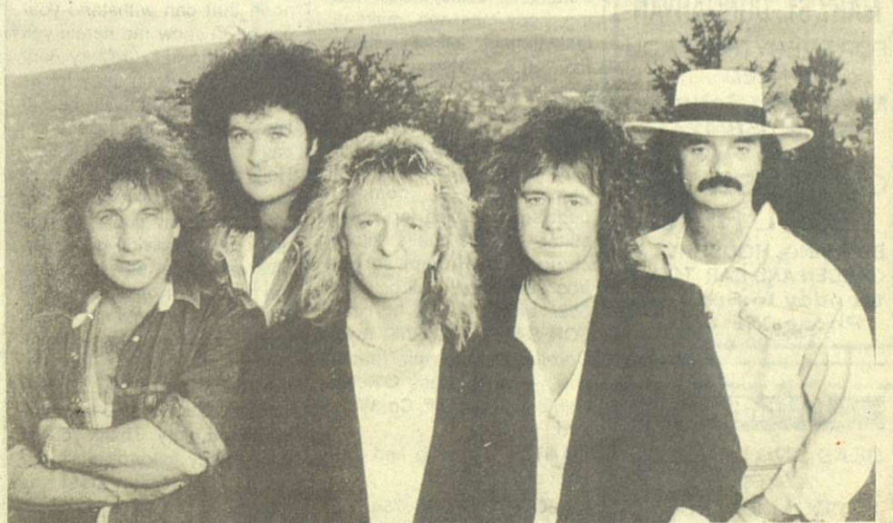
SMOKIE — Playing at Conna Castle on Saturday, June 3.