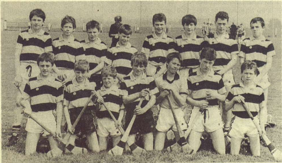
Lismore, who defeated St. Saviours in the Under 14 Hurling Feile Na Gael Co. Final at Fraher Field, Dungarvan, recently.