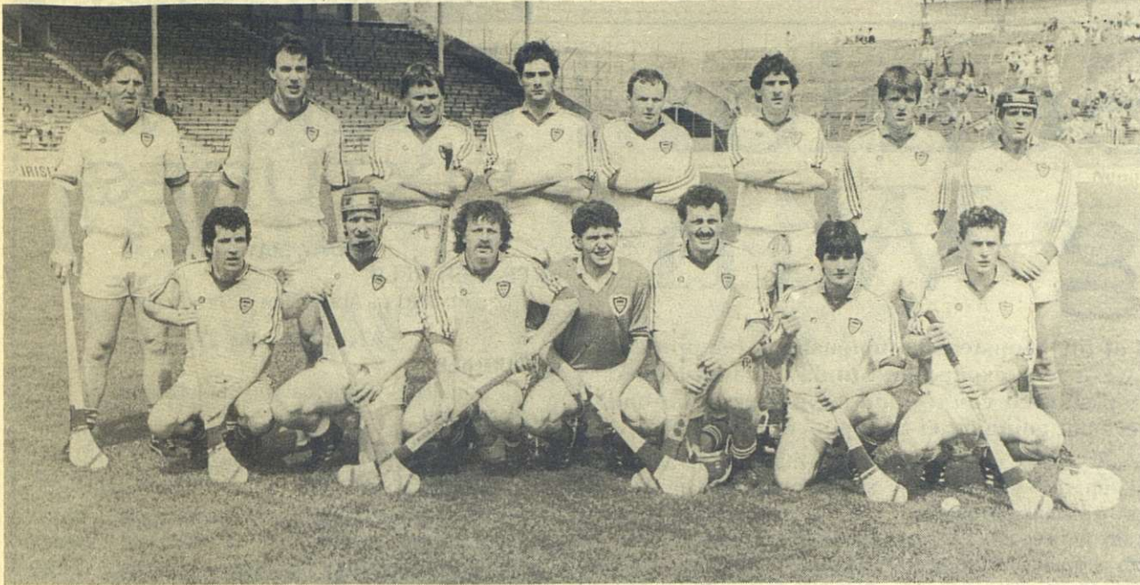
The Waterford senior hurling team who defeated Clare in the first round of the Munster Championship at Semple Stadium, Thurles on Sunday last.