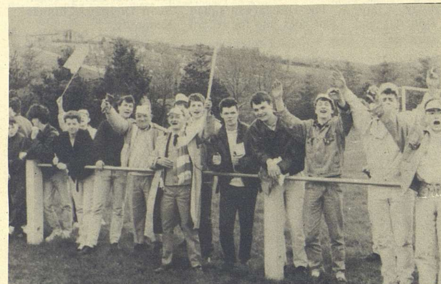
All set to go as supporters prepare for the kick off.