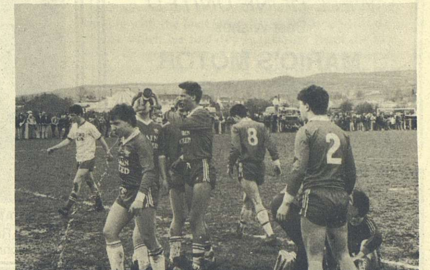
Dungarvan players cooling down during the course of the game.