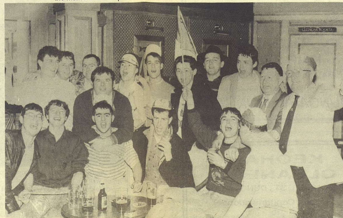
Happy group of supporters pictured before setting off on the last lap of their journey to the game.