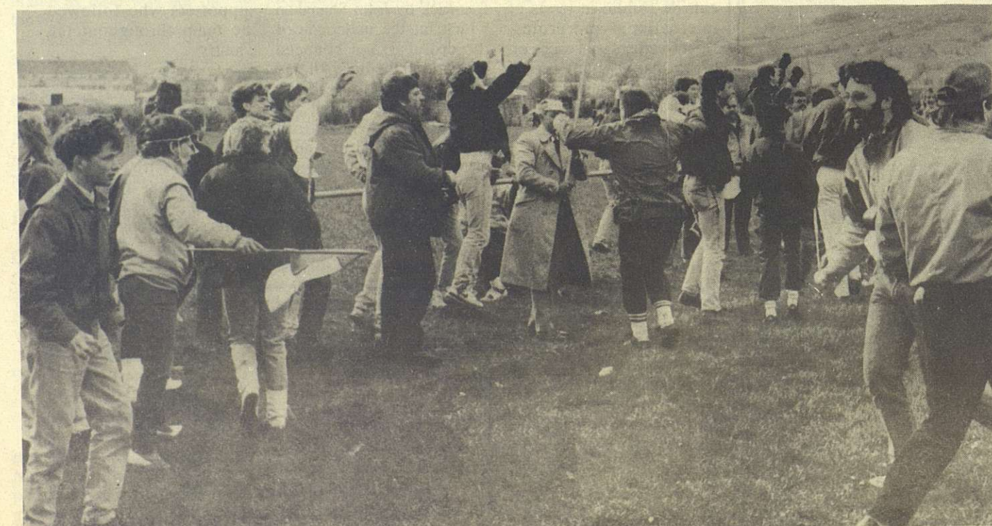
IT'S THERE! The final goal goes in, the tension is relieved and spectators can breathe easily at last as Dungarvan hold a 3-1 lead.