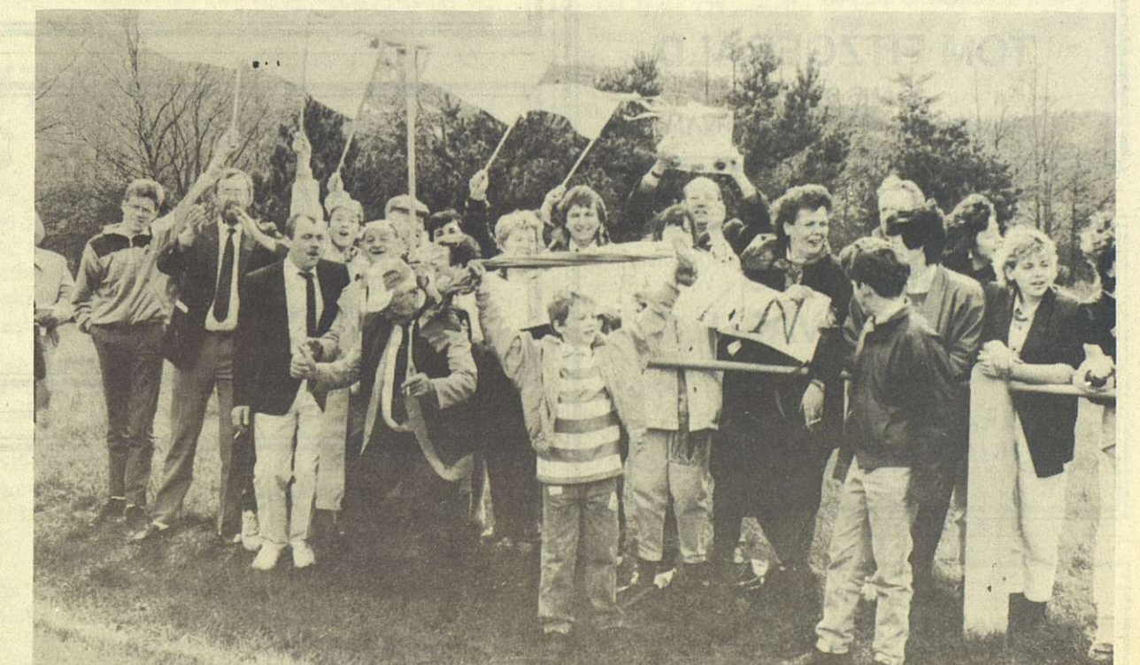
Dungarvan supporter in jovial mood prepare to shout on the team as kick off time approaches.