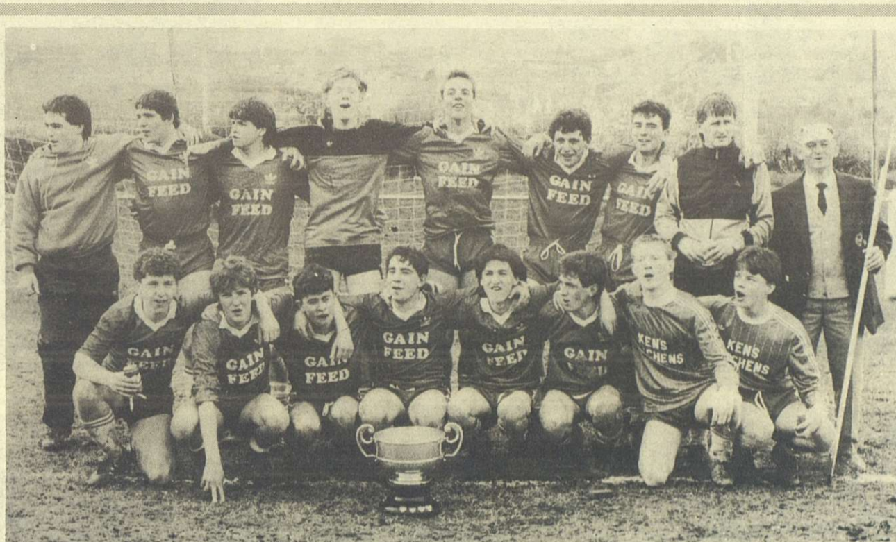
A JUBILANT DUNGARVAN SQUAD DISPLAY THEIR ALL-IRELAND TROPHY