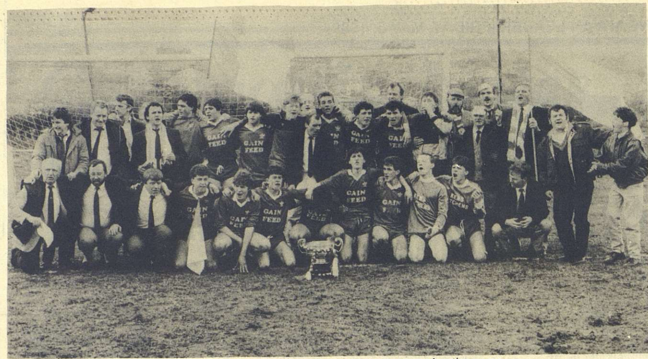
A jubilant team and supporters photographed with the cup after the game.