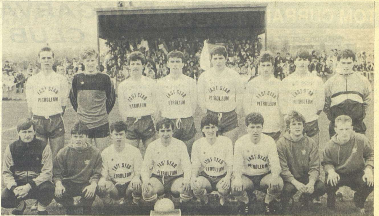
Dungarvan United Youths team pictured before their All-Ireland clash with Milford (Donegal), played at Ozier Park last Sunday.