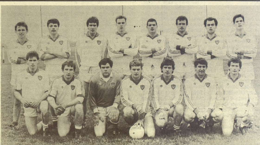
The Waterford Senior Football Team who defeated Carlow, in their National Football League game at Fraher Field on Sunday last.

The final of last year's Phelan Cup will take place early in March when we play Butlerstown in the final, so certainly a good omen for an early victory!