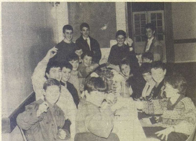
Pictured above are members of the victorious Affane/Cappoquin U-14 football team, Western champions 1988