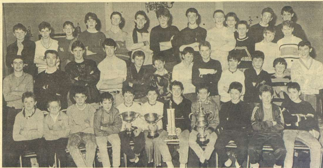
Members of the Dungarvan G.A.A. Clubs U14 and U16 teams who won the West Waterford Championships pictured at the presentation of medals in Lawlors Hotel Dungarvan.

Also to the Editor and Staff of this newspaper we wish a happy and prosperous new year and an expression of sincere thanks for the space afforded our club affairs each week.