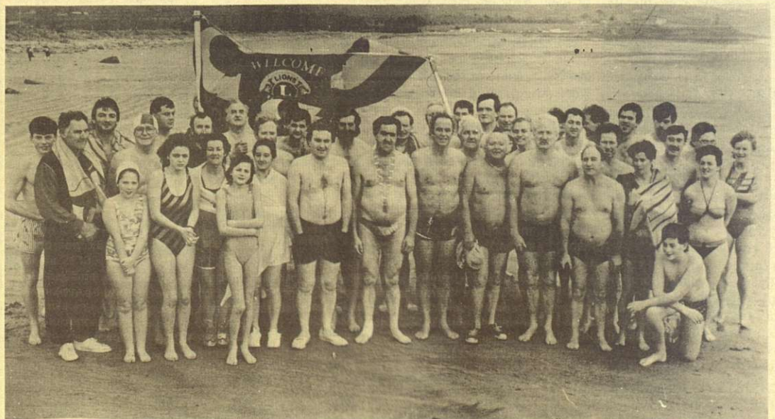
Swimmers who took part in the Dungarvan Lions Christmas Day Swim in aid of local charities at Clonea

Indeed the Minister has gone too far, principally in approving the plan to withdraw the drugs refund scheme, and we must protest against this in the strongest possible terms and call on him to think again where this is concerned.