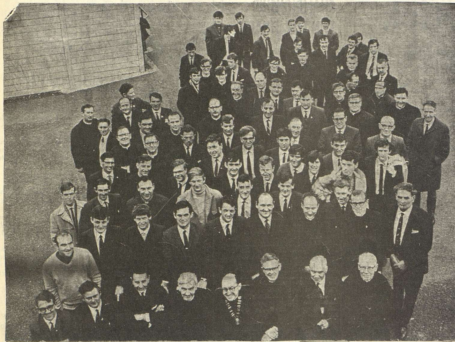
The photo for "Remembering Other Days" this week is another which goes back all of 30 years to a gathering of Past Pupils of St. Augustine's College, Dungarvan...