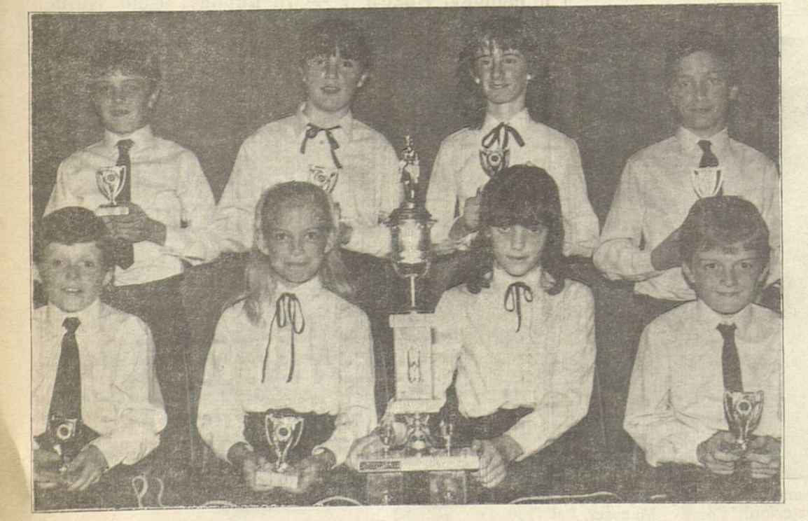
Photo shows the Ballyduff/Ballynello/Ballysaggart set dance group who won the u-16 Munster Championship at Fleadh Cheoil na Mumhan in Dungarvan recently.