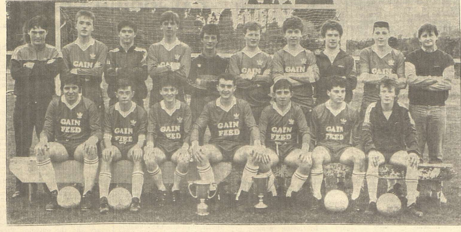
DUNGARVAN UNITED AFC U/18 TEAM, winners of Waterford Youth League 1987/88 and FAI Cup Area Final 1988.