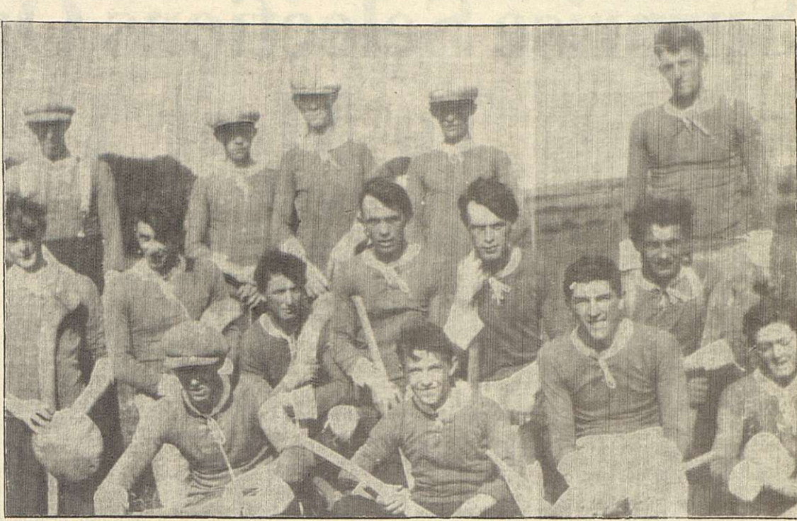
The photo for our 'Remembering Other Days' series this week takes us back to the years 1929/30. It shows the Ballynoe Junior Hurling team of that era which participated in the East Cork Championships. Many of the team have now passed to their eternal reward.