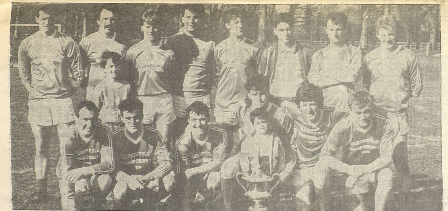
Brideview United, Tallow pictured with the Dungarvan Tyre Centre Cup which they won when beating Piltown 3-1 in the final played at Lismore recently.