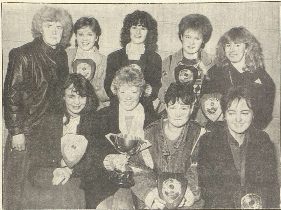
Dungarvan GAA Club's Figure Dancers, winners of that section at the Scor County finals which were held at Kill Community Centre recently.