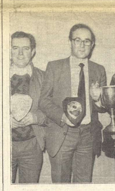
Sliaib gCua Novelty Act, winners of that section at the Scor County Finals at Kill Community Centre.

Cllr. P. Coffey said that they were addressing the resolution to the wrong body as it was to the Department of Finance and not to the European Parliament it should be sent. He added that the Minister had recently informed the General Council of Co. Councils that if and when