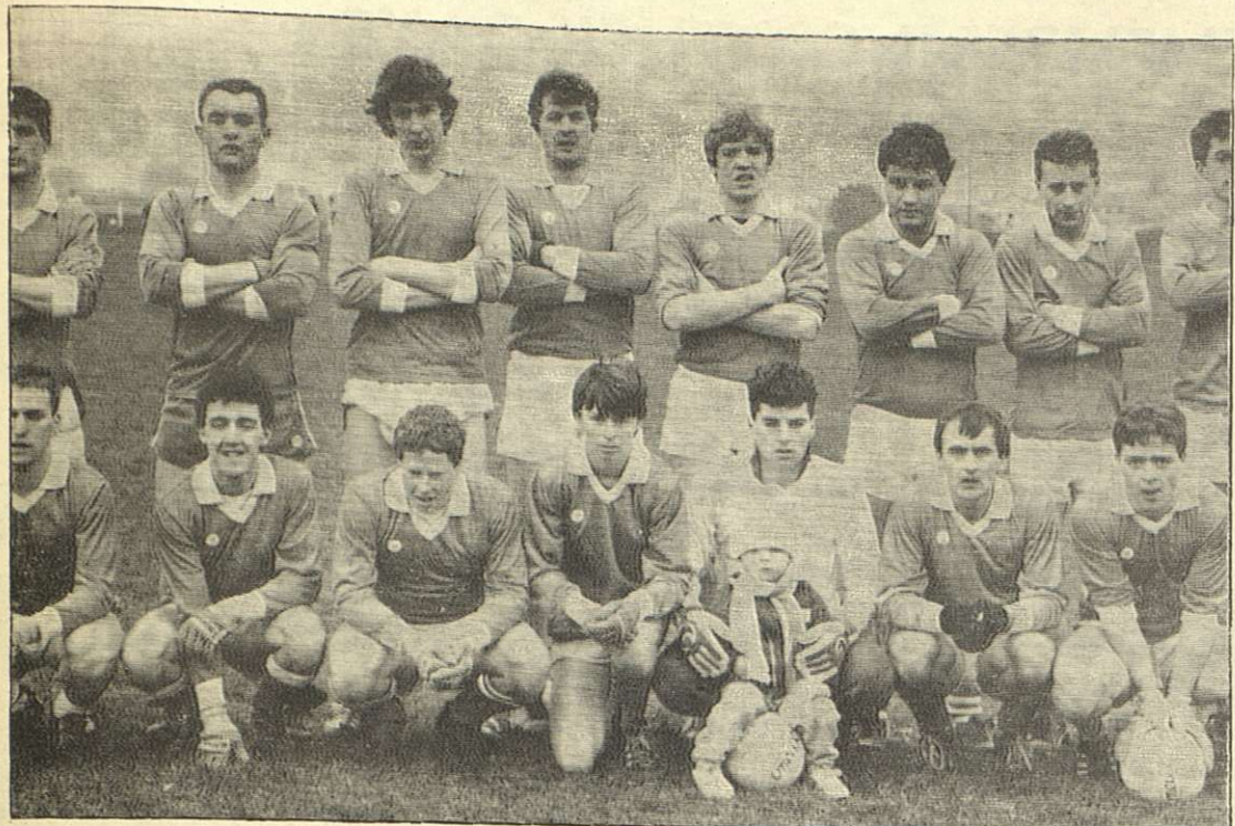
The Dungarvan Under 21 footballers who made history in 1987 by completing the county u-21 championship double, giving the Old Boro' club the distinction of being the first club to win the hurling and football titles in the grade in the same year.