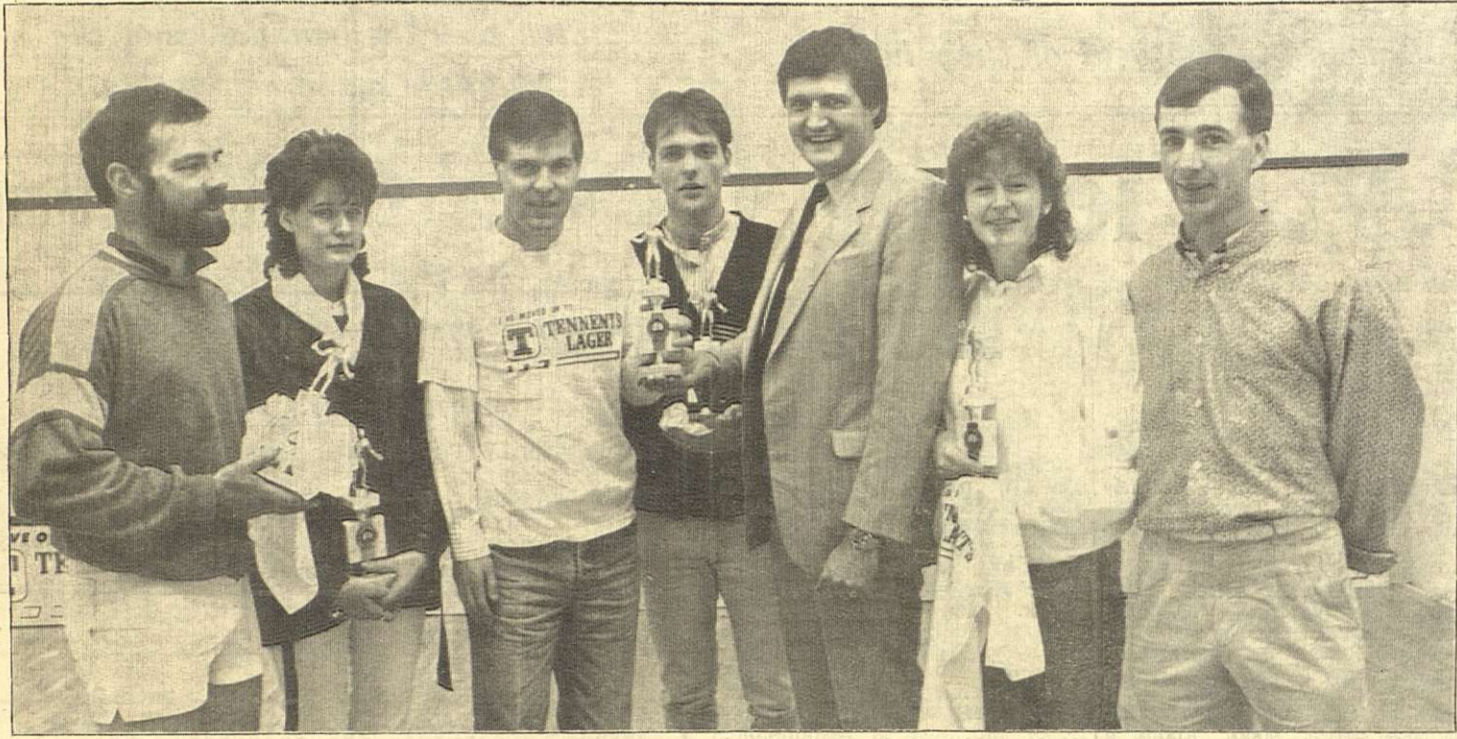
Dungarvan Rugby Club Notes