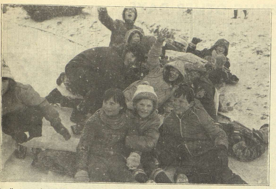
A pile-up on the Ski Run at Shanbally, Cappoquin, during the recent snow.