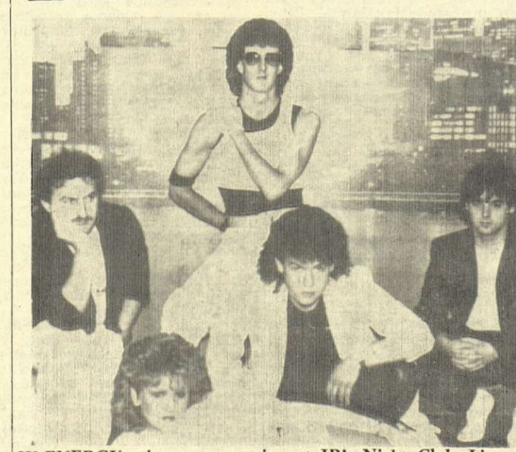
HI-ENERGY who are appearing at JR's Night Club, Lismore Hotel, this Friday night, November 21.

Music by: Society Four - Subscription £10