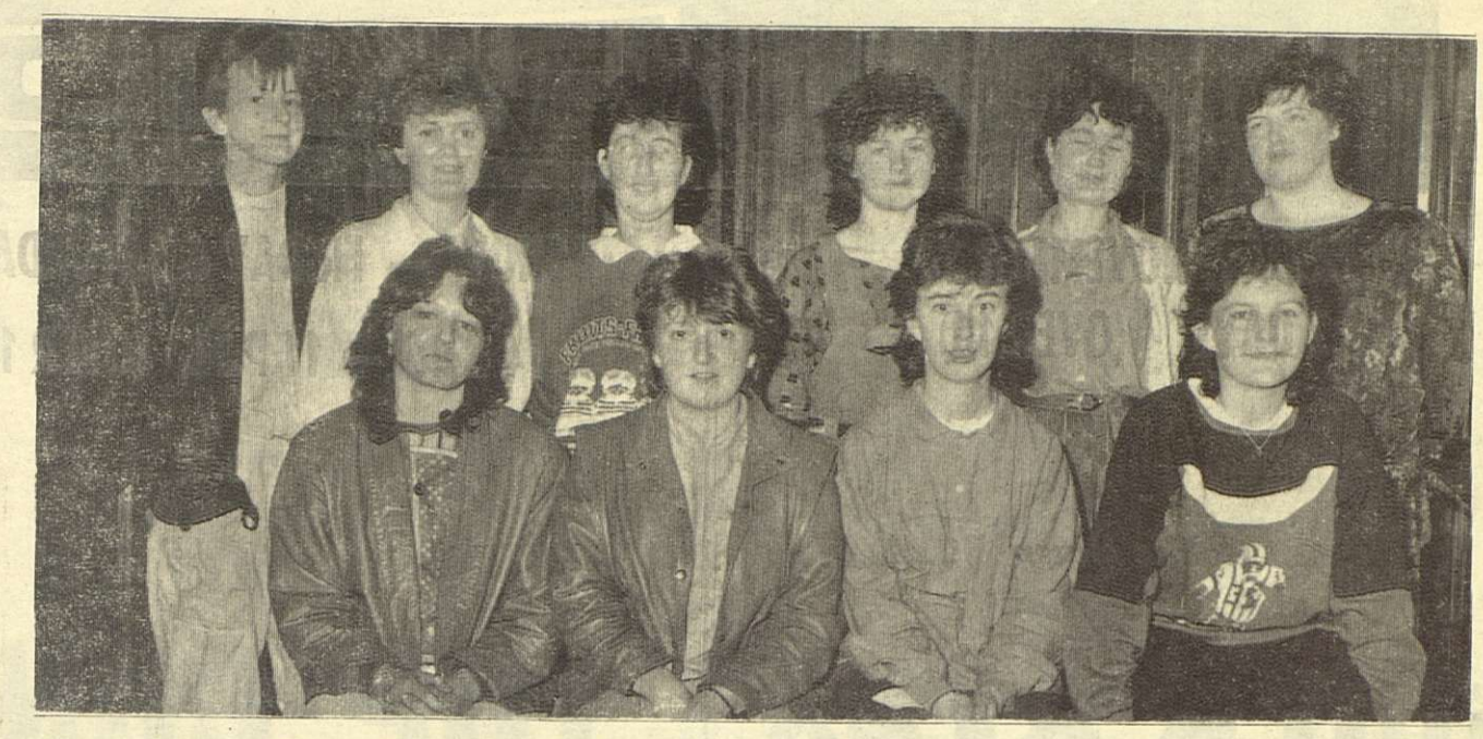
Officers of Clonea Power, Tallow and Ballymacarbry, who attended a Macra na Feirme Leadership Course, which was given at Clonea Strand Hotel.