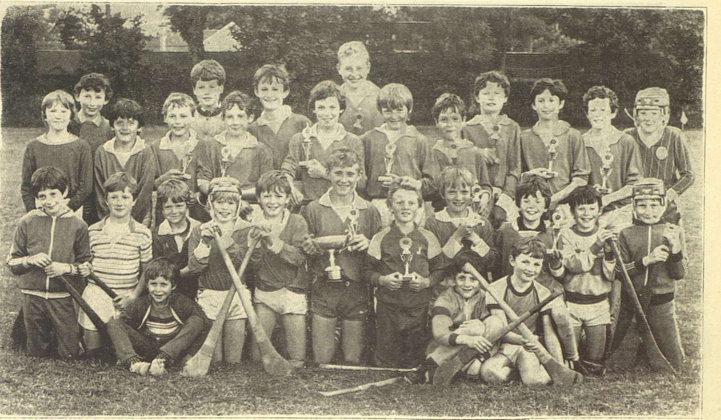
Ballyduff Upper team, winners of the Primary Schools League B Final (Corn na mBrathair).