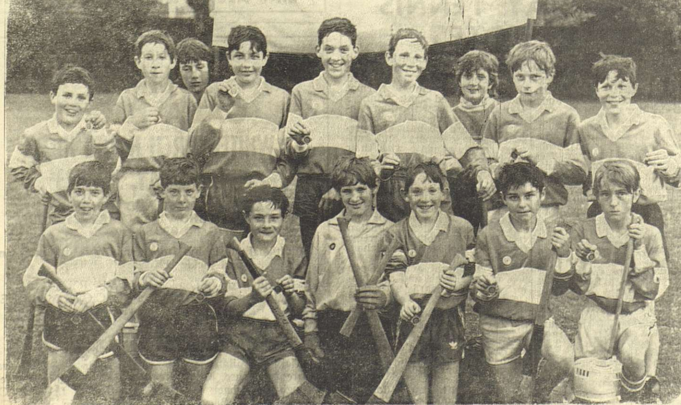
The Ballinacorney team, runners-up in the Primary Schools League B Final.