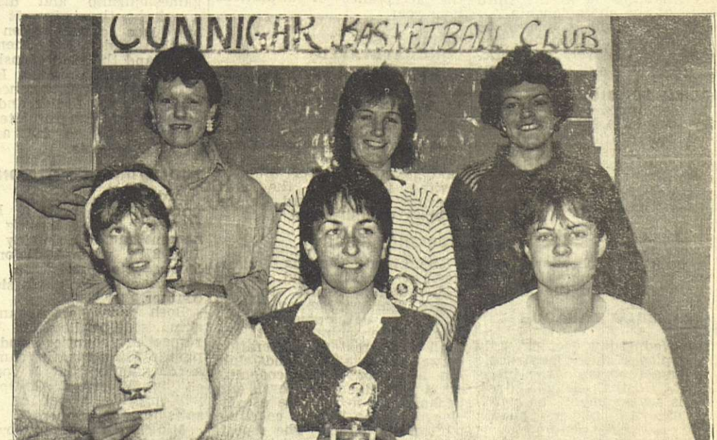
Cunnigar Basketball Club ladies team, runners-up in the Novice Cup.