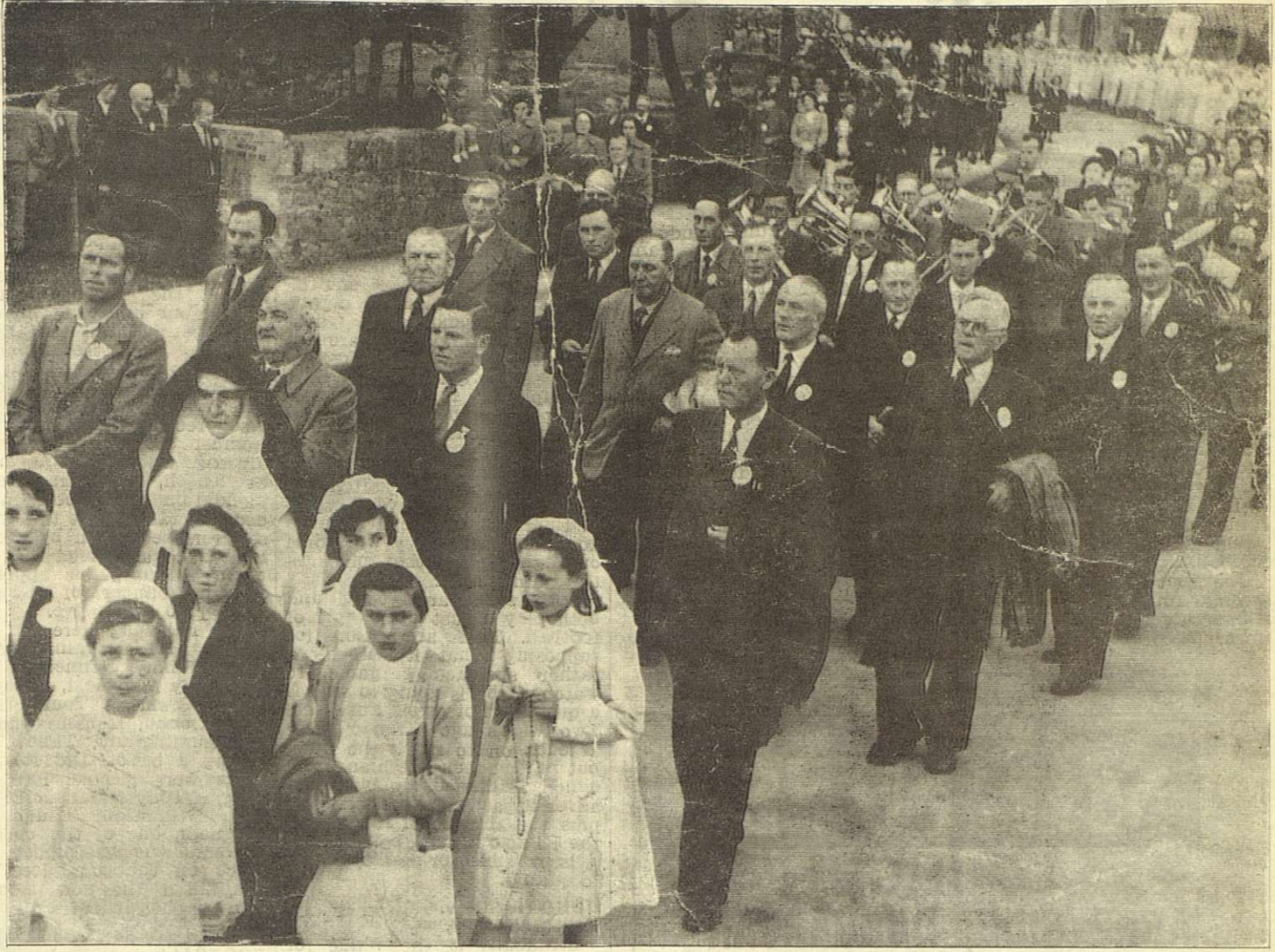
The photo in our "Remembering Other Days" series this week recalls the scenes of great devotion at the historic Rosary Rally held in Dungarvan more than thirty years ago on the occasion of the visit of the great Rosary Priest, Fr. Peyton. People flocked to the Old Boro' from all over the county for the occasion and our photo shows members of the then Dungarvan Urban and Waterford County Councils as the procession marched along Shandon (where the Fire Station now stands) en route to the Gaelic Field where the great rally took place. In the background is the Dungarvan Brass Band with the Children of Mary following on behind. Our thanks to Sr. M. Baptist, District Hospital for loaning us the photograph.