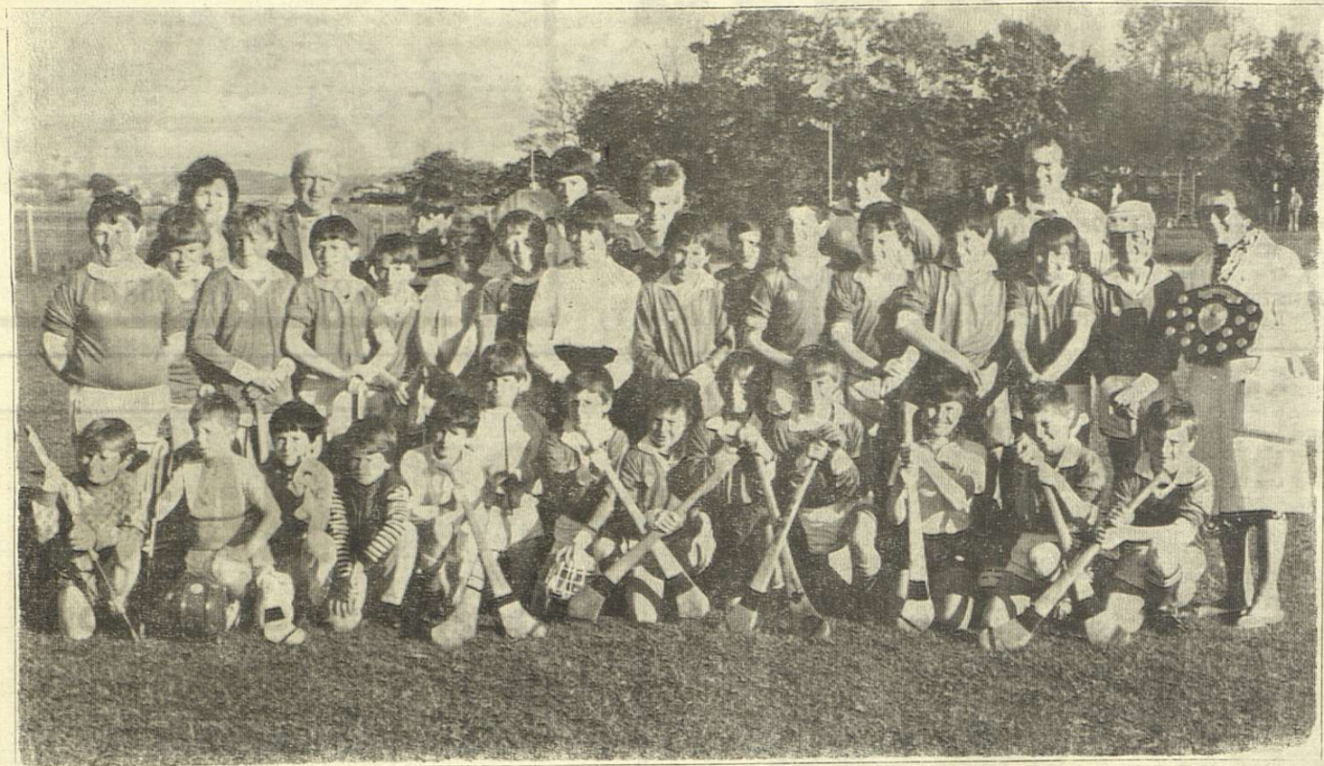
Ardmore, winners of the Primary Schools League 'C' Final for the Bridin Ni Christoir Shield.