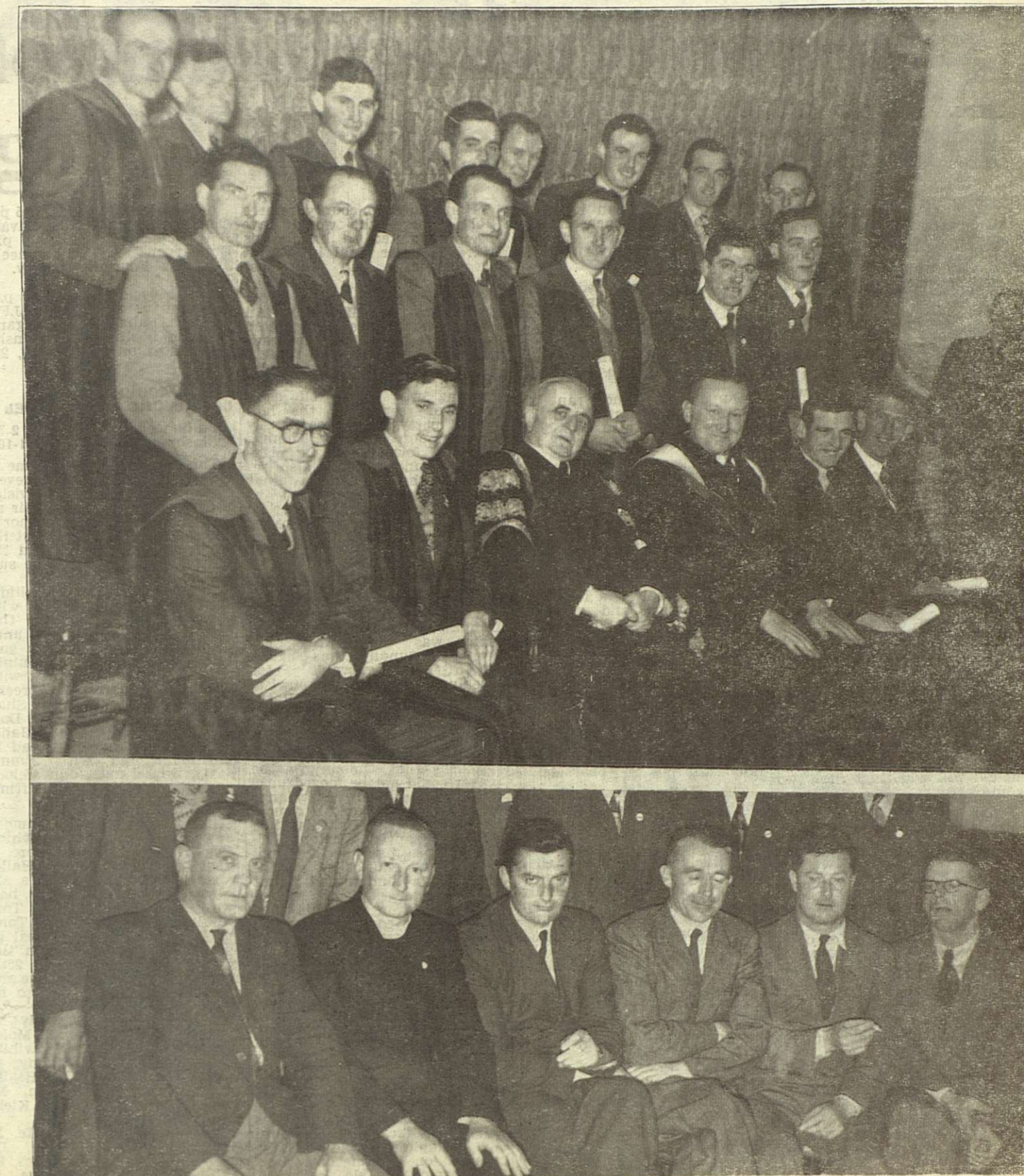
The photos in our "Remembering Other Days" series this week recall the first Social Science Course conducted jointly by the University College, Cork with extra mural studies at Dungarvan Technical School, Dungarvan and Newcastle West were chosen as the two centres for the pilot scheme of these Adult Education Courses and above we show the members of the Dungarvan Macra na Feirme who participated in the course on the occasion of the conferring of diplomas at the successful conclusion in 1952.