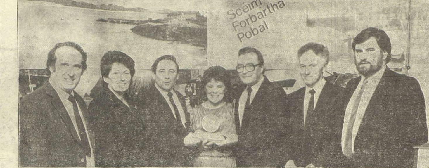
Members of An Coiste Forbartha, An Rinn, who received the Award under the Community Development Scheme organised by Udaras na Gaeltachta from the Minister for the Gaeltacht in Galway last Friday.

Our senior hurlers tasted defeat in the championship last Sunday